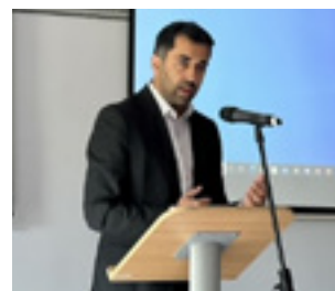
Humza Yousaf Cabinet Secretary for Health and Social Care

The presentation was followed by a lively question-and-answer session from the audience which covered a range of issues, including: the Scottish Government's policy to abolish NHS dentistry charges; long-term contractual reform; engagement and communication with the profession; and workforce challenges.