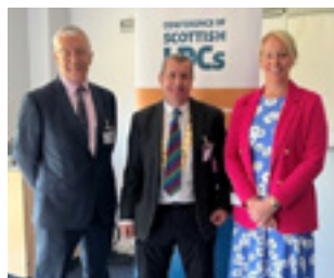
CDO, Chair and DCDO