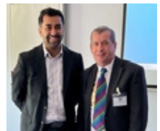
Cabinet Secretary and Chair